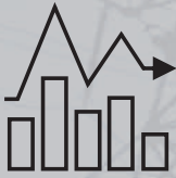
Highly Fluctuating Load