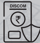
Financial Penalty by DISCOMs for Ineffective P. F. Maintenance